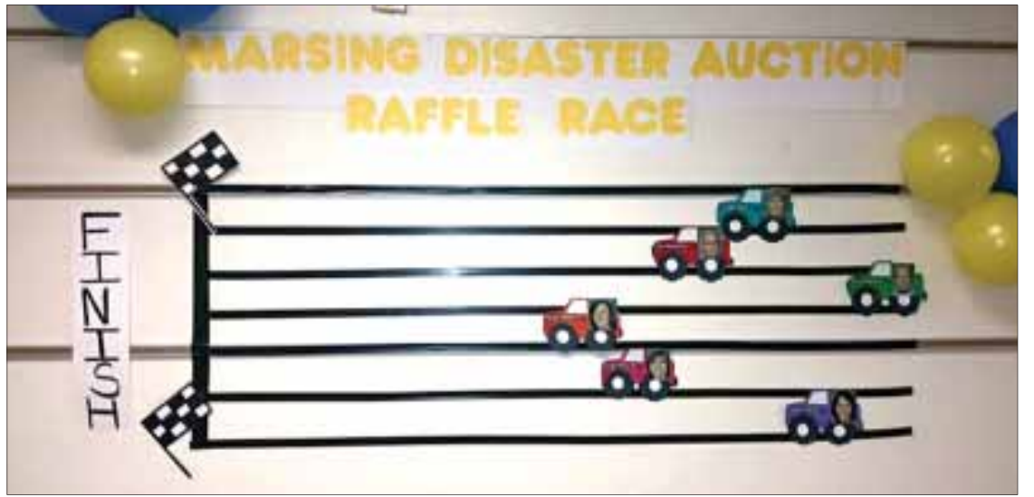
The progress of each classroom is being gauged with this scoreboard at school.

• Savage Trophy Hunter .270 rifle and Nikon scope donated