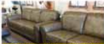
LANE SOFA & LOVE - SAVE $100'S NOW $1295