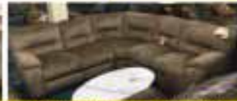
LANE SECTIONAL - SAVE $100'S NOW $1795