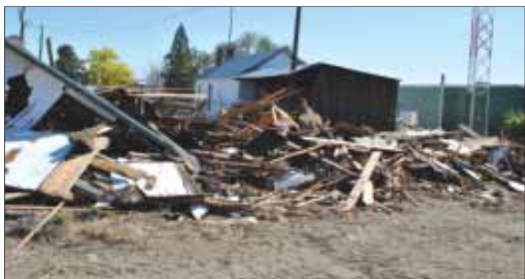
Before: The old military barracks (a.k.a. "The Pie Shop") lay in splinters.