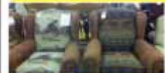
Wildlife or Western Print Chairs