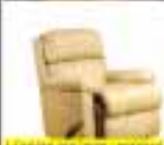
LEATHER RECLINER - PERFECT FOR THE MOTORHOME! NOW $549