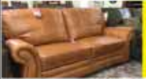
LANE RANCH STYLE ALL LEATHER FURNITURE SAVE $100'S