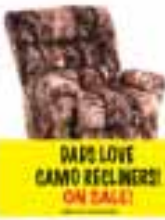
DAD'S LOVE CAMO RECLINERS! ON SALE!