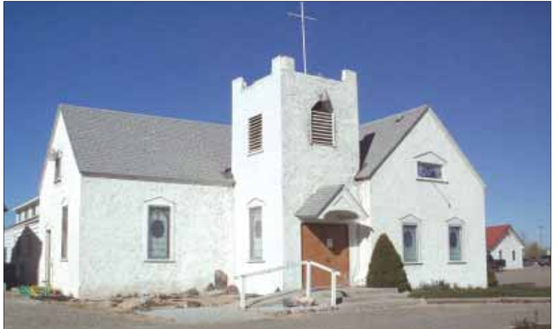
Knight Community Church's congregation has met in this building for nearly 90 years.

Cunningham explains, "Life was a struggle in this newly