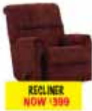
RECLINER NOW $399