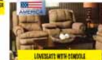
LOVE SEATS WITH CONSOLE