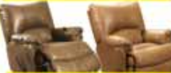
LANE ROCKER RECLINERS LEATHER $799 • MICROFIBER $699