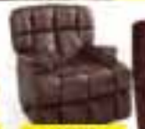
LEATHER BIG MAN RECLINER NOW $899