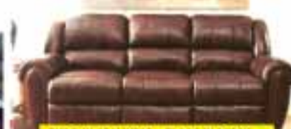
BUILT-IN RECLINERS - BLACK IN STOCK