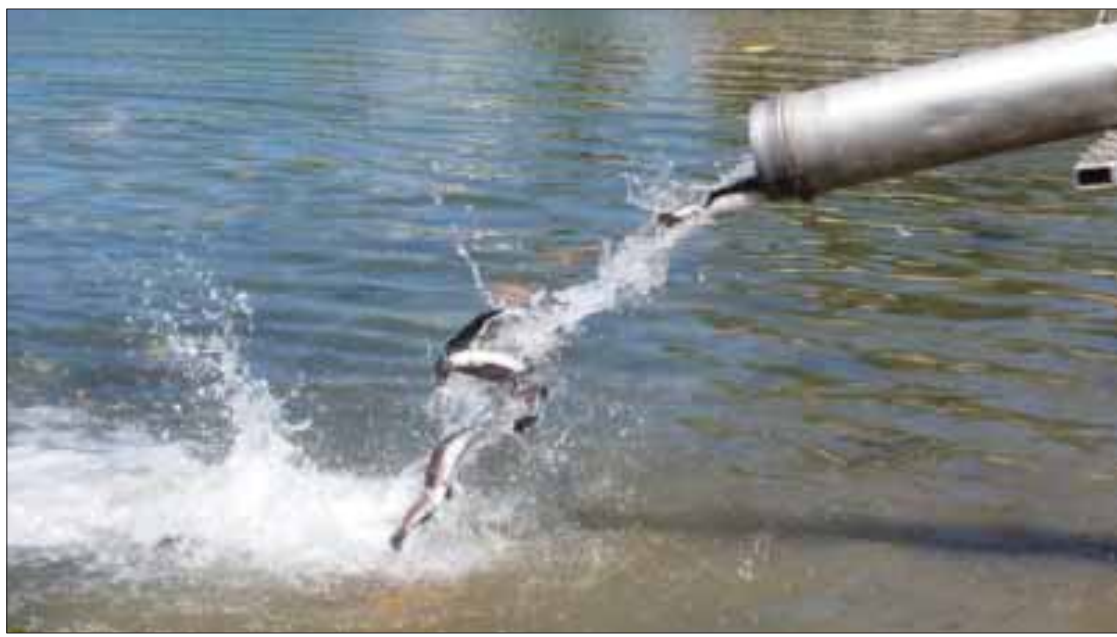
Plenty of trout were planted in the Island Park pond Friday.

Find out What's happening Read Calendar each week in the Avalanche