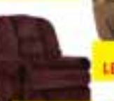
BIG MAN RECLINER NOW $699