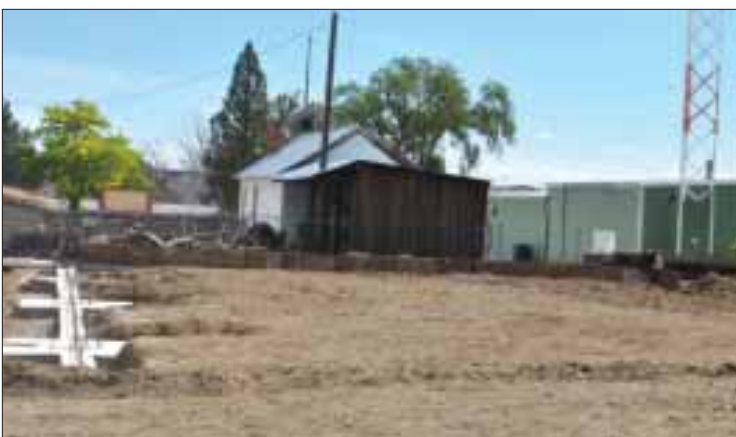
After: With the land cleared, a foundation has been started for the museum expansion.

The Owyhee County Historical Society's (OCHS) board of directors is inching forward with an ambitious expansion plan for the museum in Murphy.