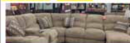
LANE SECTIONAL - SAVE $1000 NOW $2799