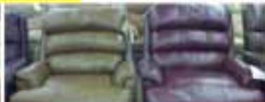
LEATHER RECLINERS NOW $699